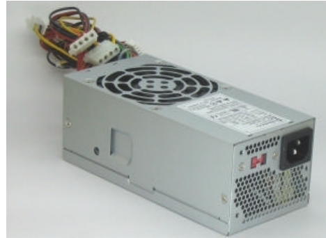
Dimension ( L x W x H ) : 175 x 85 x 65 mm